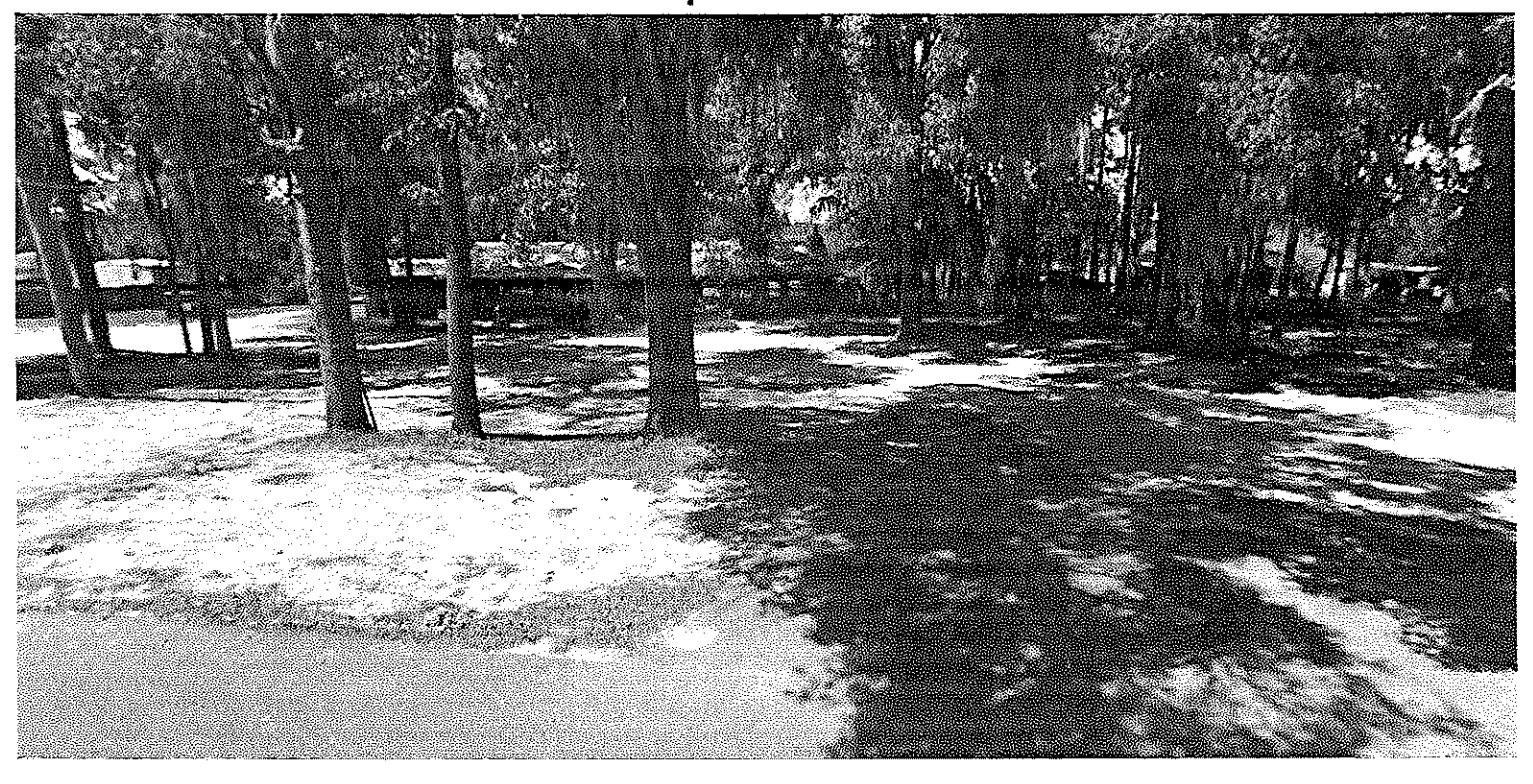
The Fish Net 3949 Sportsman Cove Rd