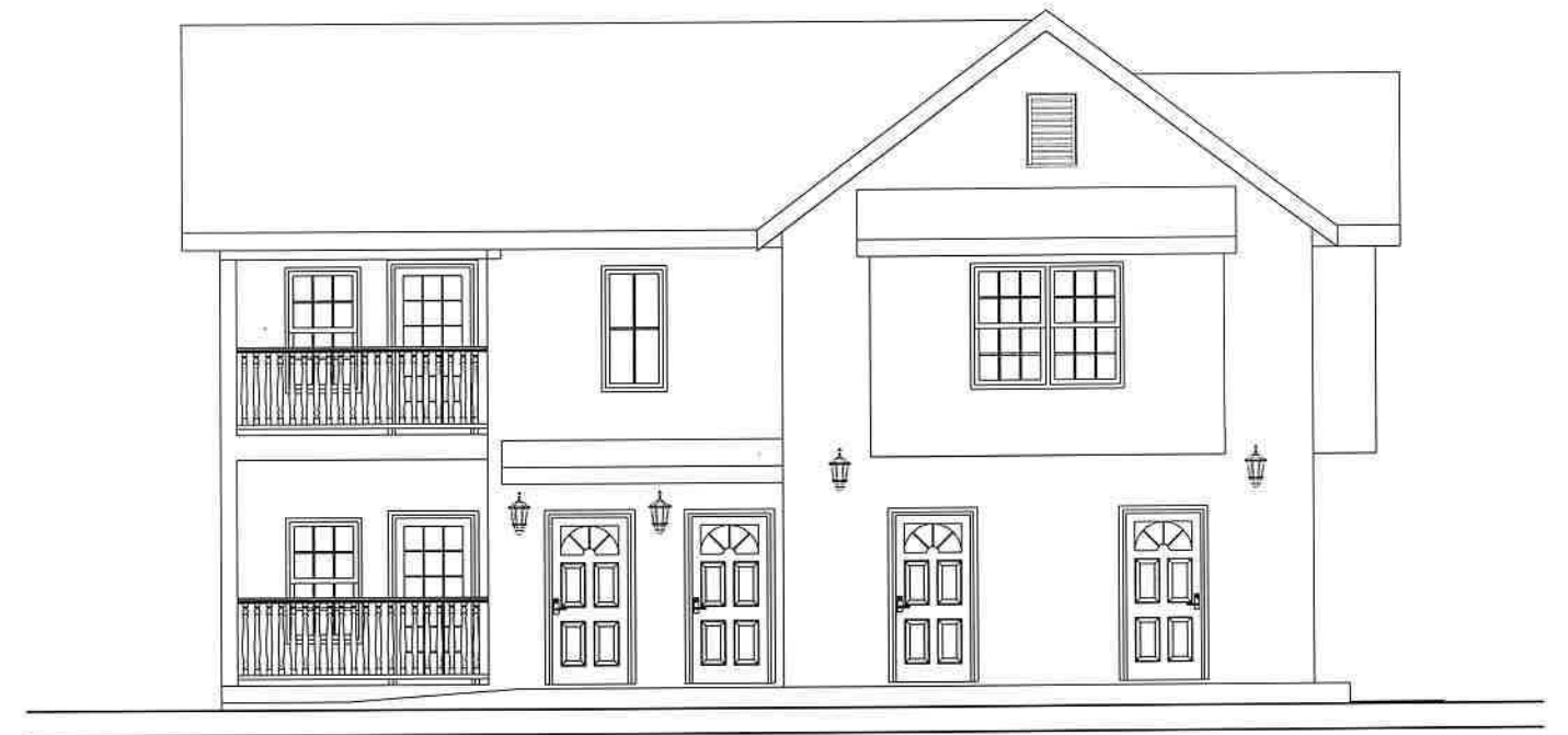
① Rear Elevation